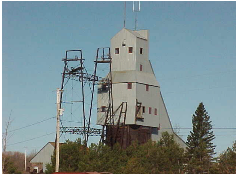
Mine shaft house, Quincy Copper Mine, Hancock, Michigan

Instruction in the geophysical development and use of magnetic field maps is needed.